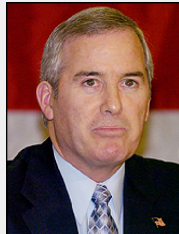
Everett Public Schools Superintendent Frederick Foresteire