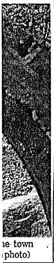
ie town (photo)

36 Pages PRICE: Home Delivery 45¢ / Store 50¢